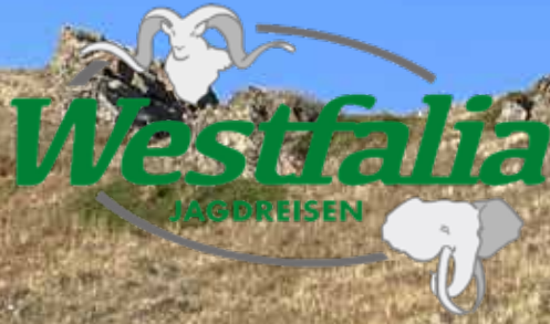
Ibexhunt in Kazakhstan 2024 Toparea: Alakol